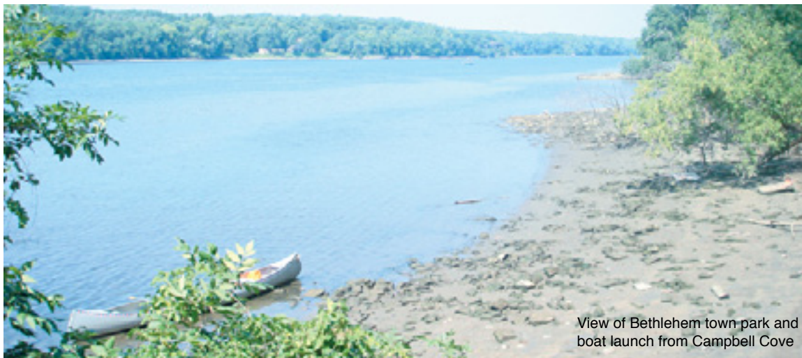
View of Bethlehem town park and boat launch from Campbell Cove