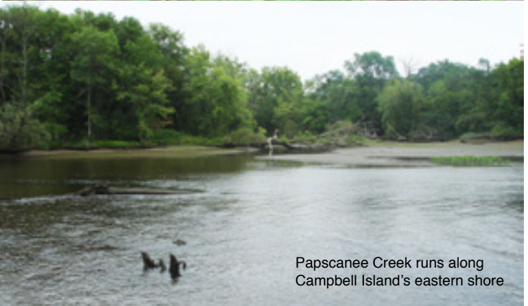
Papscanee Creek runs along Campbell Island's eastern shore