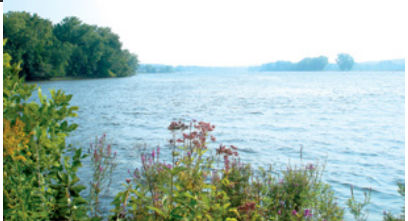
View from Campbell at high tide looking south to the mouth of the creek bordering the island, with the Village of Castleton in the distance >

Campbell is an island-peninsula whose western shore runs over a mile along the Hudson; its eastern shore lies on the Papscanee Creek leading to the Papscanee Island Nature Preserve off Route 9J. Access is by foot, water and air. Boat launches are nearby including directly across the river, one mile south at the state park, and in Albany. Wildlife and flowers abound in deep woods with trails, while sandy beaches grace the shore.